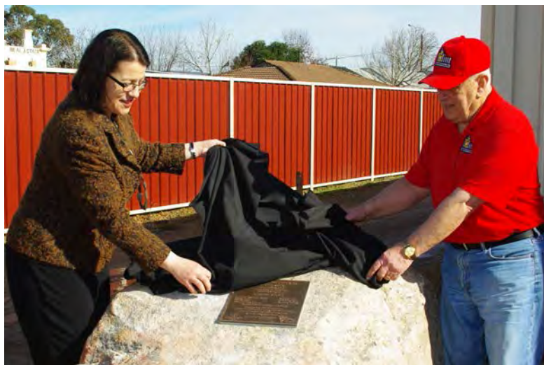
Official unveiling of the Plaque by Jenny Mikakos, Minister for Department of Health and Human Services who helped fund the building of the shed through the Strengthening Men's Sheds Grants.