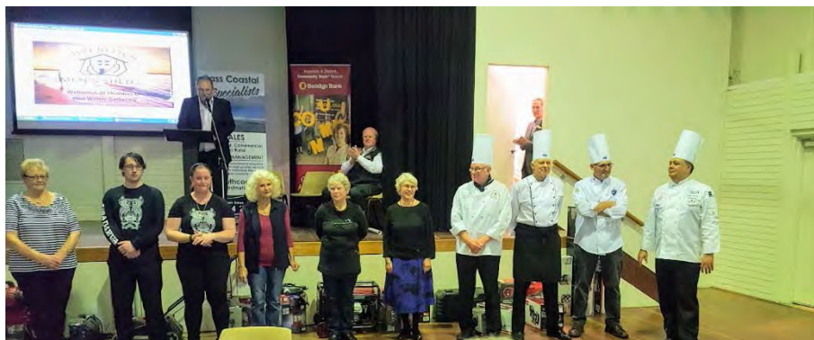
The Gathered Shedders were ecstatic with the catering at the Inverloch Gathering and expressed this to our Chefs and Servers pictured.