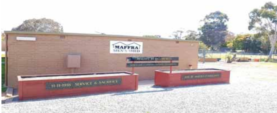
Commemorative Garden at Maffra Men's Shed – 19 Gibney Street, Maffra

The group has successfully run two 'Bunnings' Barbeques and has raised (some) operating funds through it's 'Kindling Wood' project, street barbeques in Maffra and individual projects that have 'come along' from the Maffra Community.