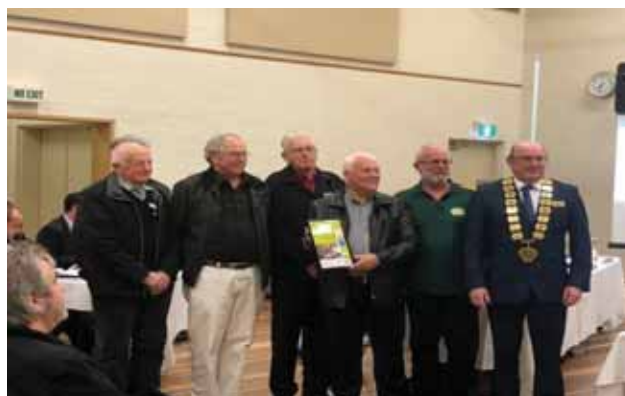
The Peninsula North Men's Shed wins the "Promotion of Intergenerational Opportunities" award from the Honourable Mayor of Mornington Peninsula Shire Councillor, Bryan Payne

The Peninsula North Men's Shed works on inter-generational projects with students like constructing a mural wall and viewing deck at the Yamarrala Wetlands with Somerville VCAL students; building a mobile chicken coop; and working on various projects with home-schooled students.