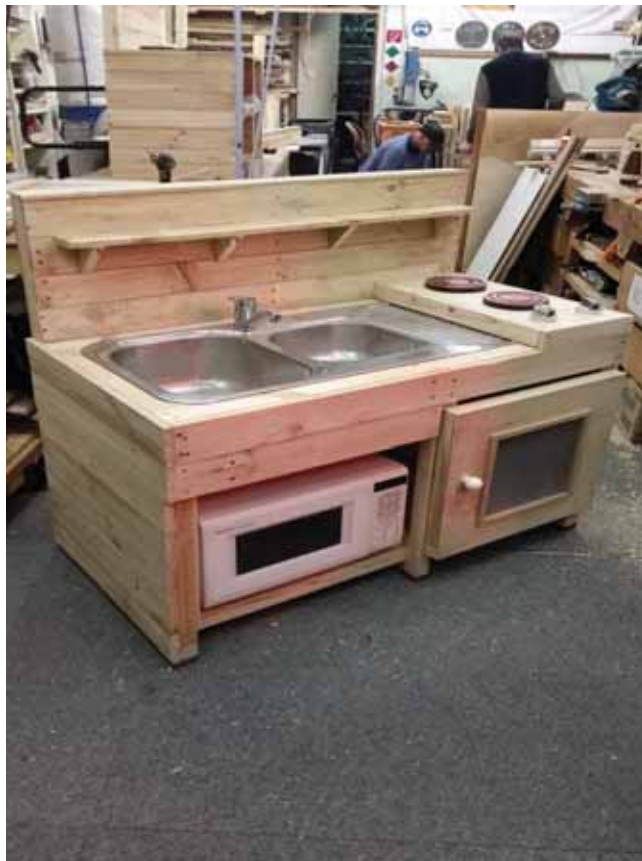
Belgrave Mud Kitchen