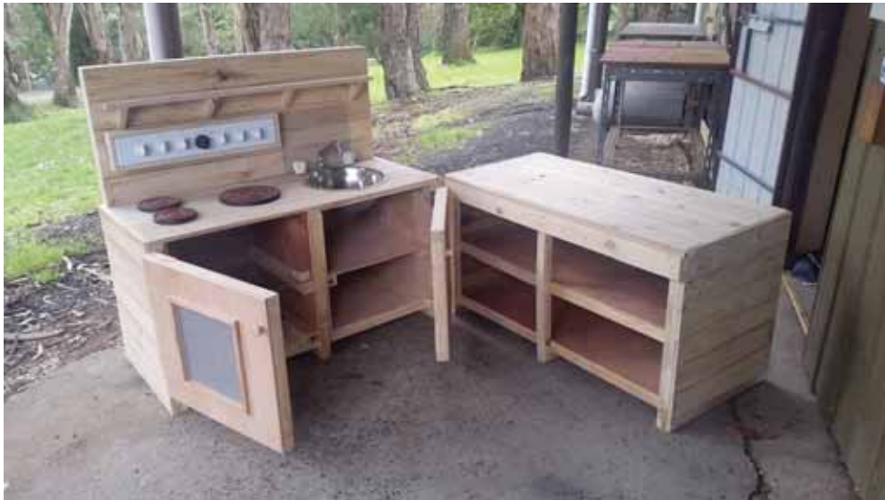
Belgrave Mud Kitchen