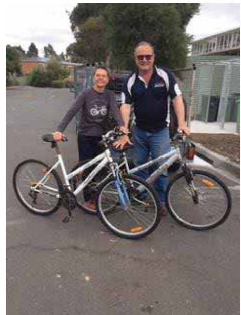
PRACE receives bicycles for Refugees donated by Mount Gambier and Heywood sheds