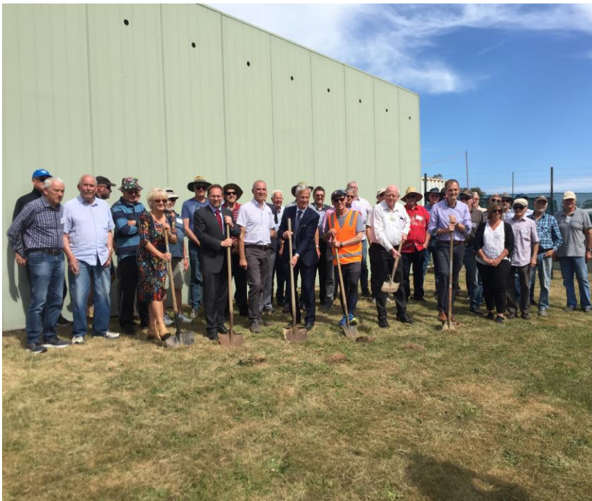
New Peninsula Shedders and Supporters get stuck in!