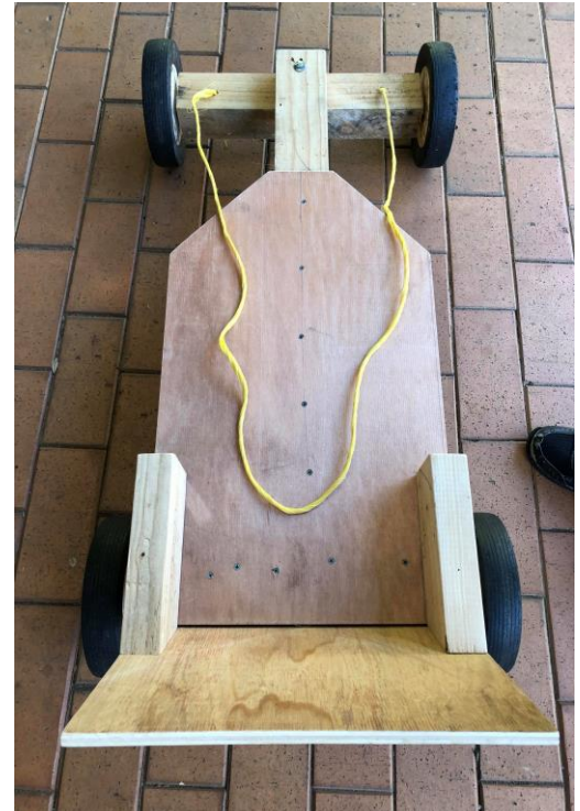
Wood work takes shape at Warrigal with plywood donated by VMSA