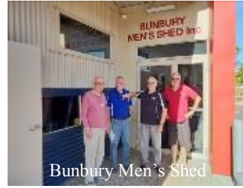
Bunbury Men's Shed