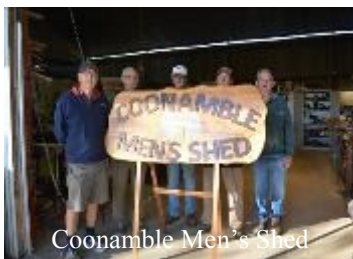
Coonamble Men's Shed