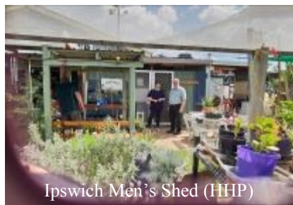
Ipswich Men's Shed (HHP)