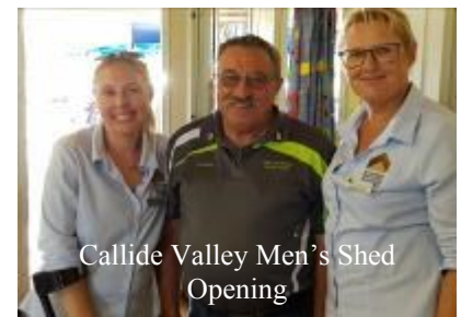
Callide Valley Men's Shed Opening