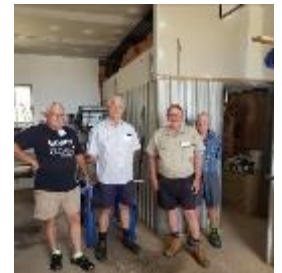
Manilla Men's Shed