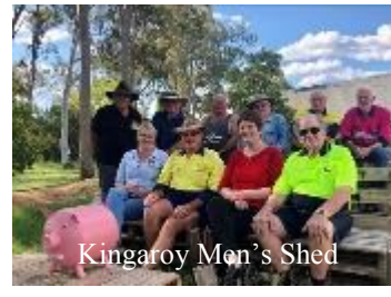
Kingaroy Men's Shed