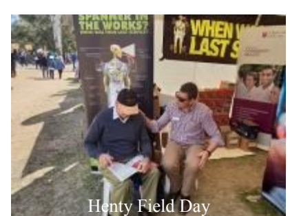
Henty Field Day