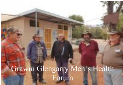
Grawin Glengarry Men's Health Forum