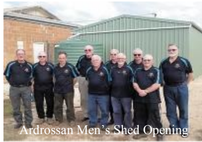
Ardrossan Men's Shed Opening