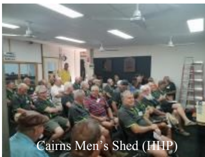
Cairns Men's Shed (HHP)