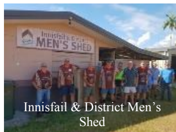
Innisfail & District Men's Shed