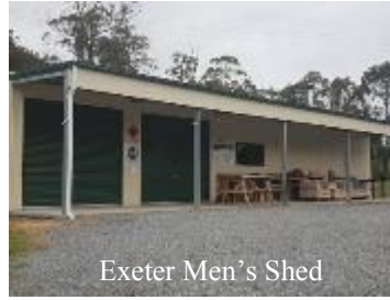
Exeter Men's Shed