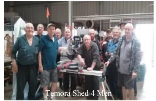
Temora Shed 4 Men