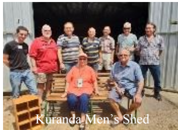
Kuranda Men's Shed