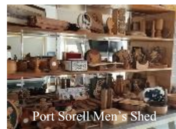
Port Sorell Men's Shed