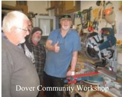
Dover Community Workshop

Some of the lucky winners who filled out the Annual Men's Shed Survey and won a tool pack valued at $1800 thanks to Total Tools.