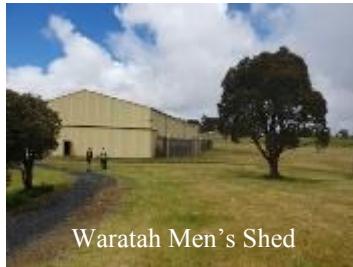
Waratah Men's Shed