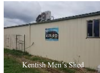
Kentish Men's Shed