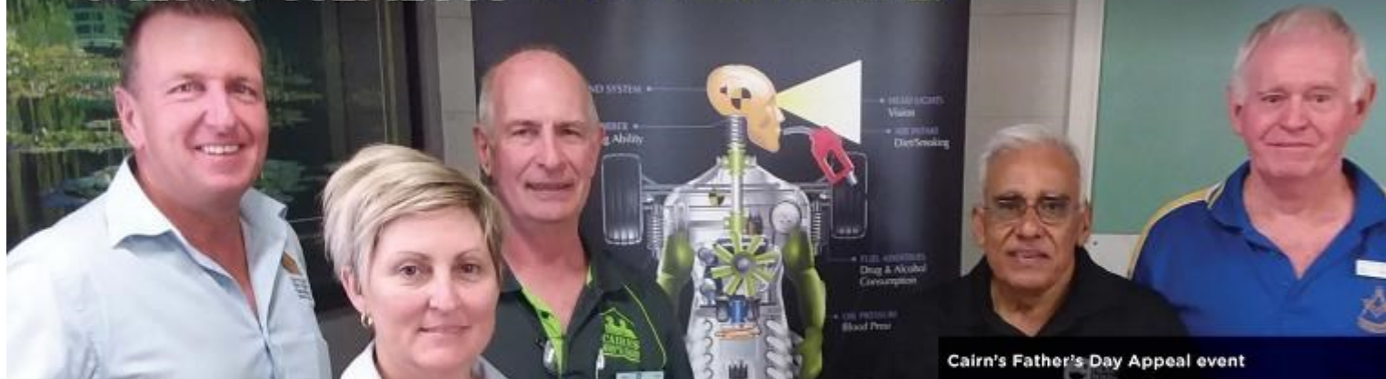
Cairns Father's Day Appeal event

Freemasons across Queensland got behind the inaugural, annual Hand Heart Pocket Father's Day Appeal to shine a spotlight on men's mental and physical health and to raise funds for their local Men's Shed.