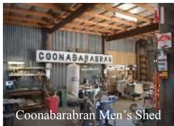
Coonabarabran Men's Shed