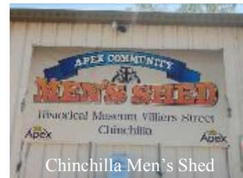
Chinchilla Men's Shed