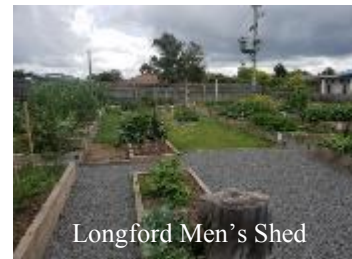
Longford Men's Shed