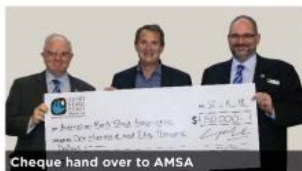
Cheque hand over to AMSA

Following the conclusion of the appeal, the Australian Men's Shed Association was presented with a $150,000 significant grant at the Hand Heart Pocket Year in Review event. This is the largest donation the organisation has ever received and will go towards supporting Men's Shed activities and programs across Queensland in 2019. This is on top of what was raised at the events which went directly to the local Men's Sheds.