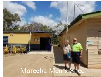
Mareeba Men's Shed