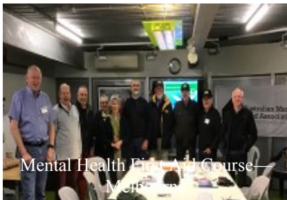
Mental Health First Aid Course