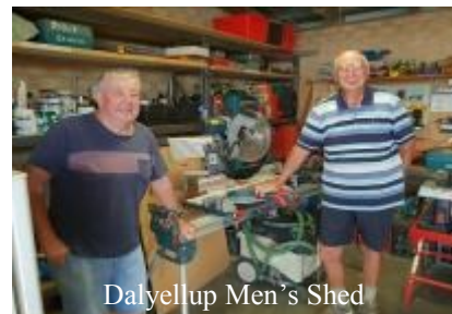
Dalyellup Men's Shed