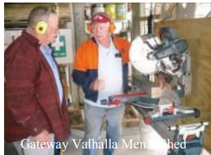
Gateway Valhalla Men's Shed