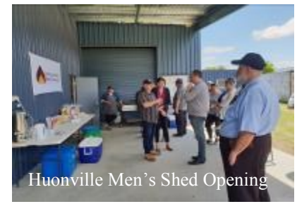
Huonville Men's Shed Opening