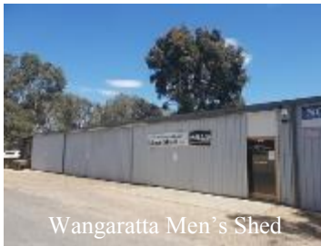
Wangaratta Men's Shed