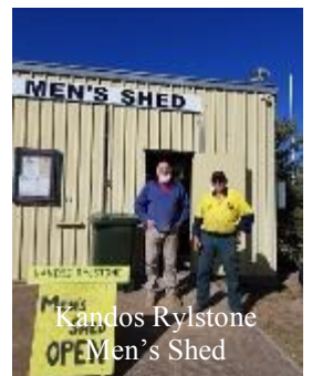
Kandos Rylstone Men's Shed