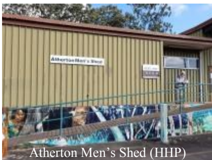
Atherton Men's Shed (HHP)