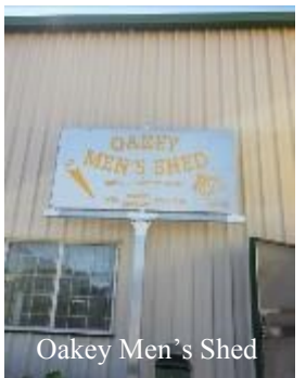
Oakey Men's Shed