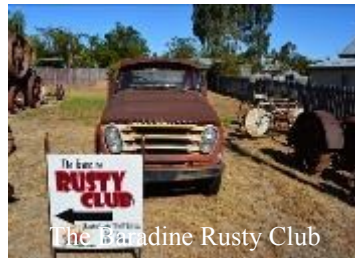
The House of Rusty Club