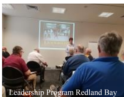
Leadership Program Redland Bay