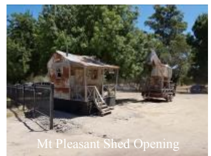
Mt Pleasant Shed Opening