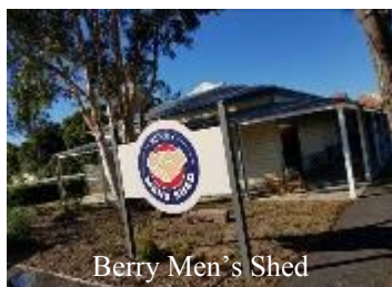
Berry Men's Shed