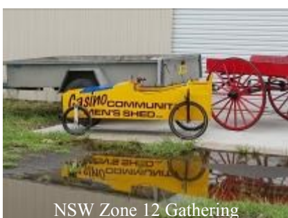
NSW Zone 12 Gathering