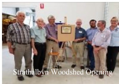
Strathalbyn Woodshed Opening