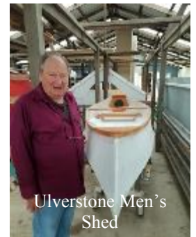
Ulverstone Men's Shed