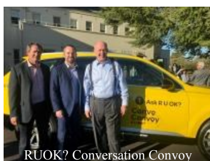
RUOK? Conversation Convoy