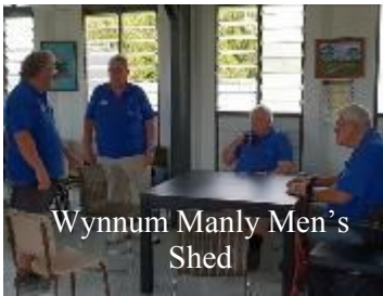
Wynnum Manly Men's Shed