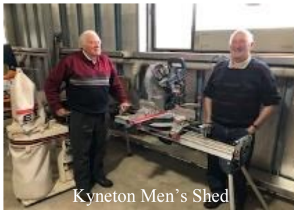
Kyneton Men's Shed