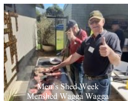
Men's Shed Week Menshed Wagga Wagga