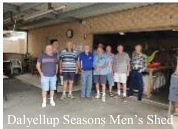
Dalyellup Seasons Men's Shed