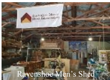
Ravenhoe Men's Shed