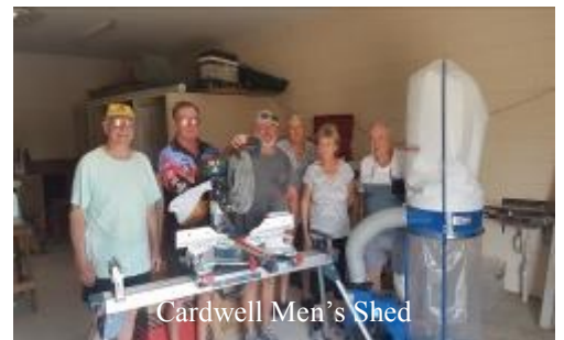
Cardwell Men's Shed