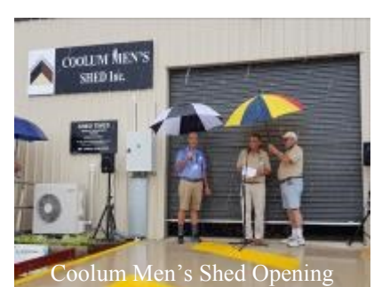
Coolum Men's Shed Opening