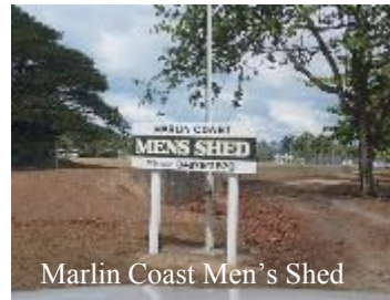
Marlin Coast Men's Shed