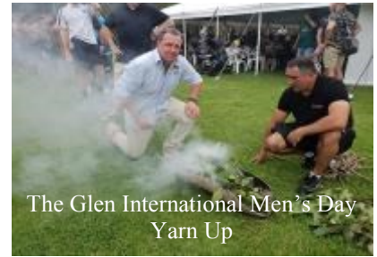
The Glen International Men's Day Yarn Up