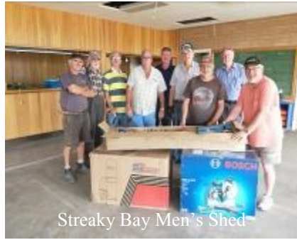
Streaky Bay Men's Shed