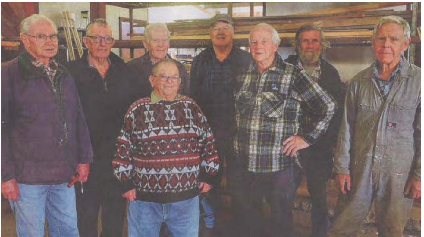
Katanning Men's Shed members

At the shed, we go about the same types of things you might find in other Men's Sheds. Part of our lease arrangement is that we do repairs and maintenance on the premises. We also make saddle racks, patio chairs and table and do general repairs on furniture—tables, chairs, chests of drawers.