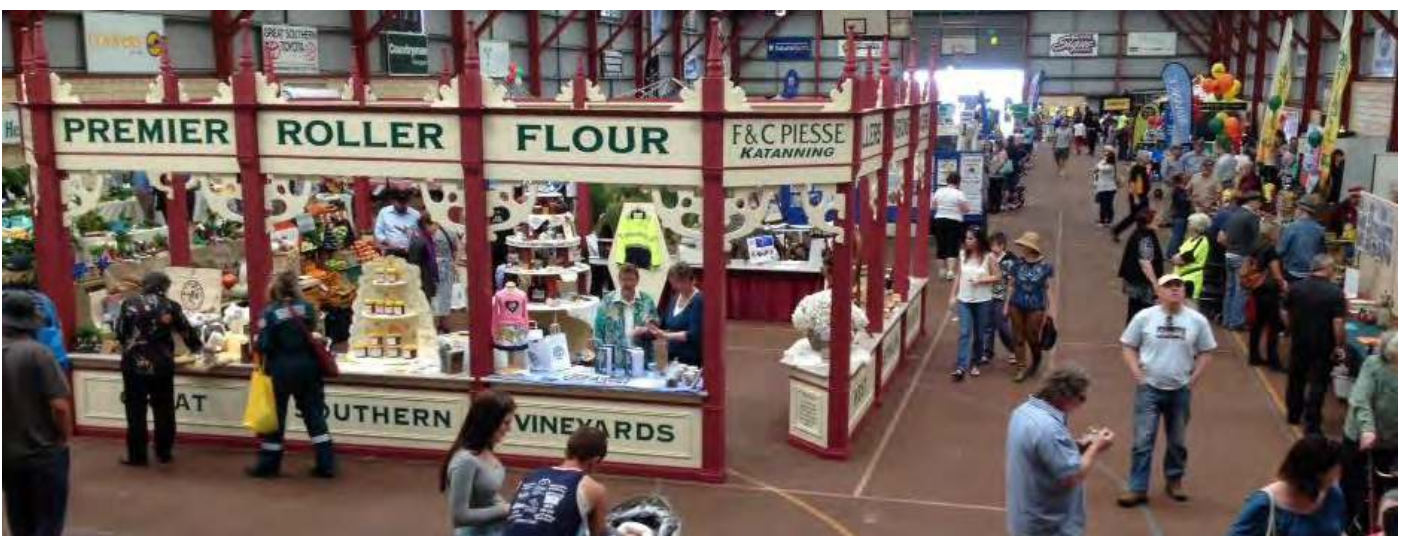
A PIECE OF HISTORY: The rebuilt display at Katanning Show.

The best thing about our shed? Every member present has a voice when it comes to what happens at Katanning Men's Shed.