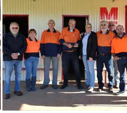
Crystal Brook Community Mens Shed (SA)