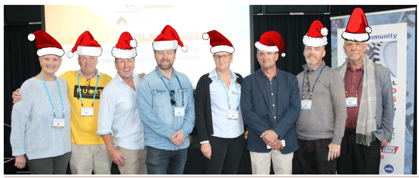
THE SHEDDER | CHRISTMAS 2019