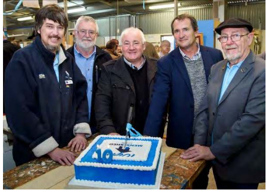
Melton Men's Shed (VIC)

Morning tea at Bellbowrie Mens Shed (QLD)