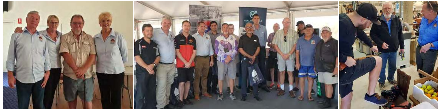
Trundle Zone Meeting (NSW)