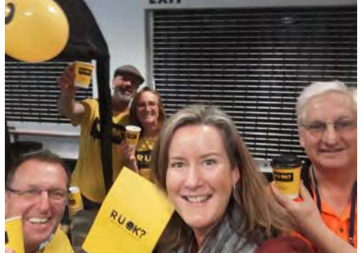
R U OK? Day morning tea at the 8th National Men's Shed Gathering, Adelaide (SA)