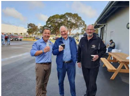
Men's Shed Week Muster, Albany MenShed (WA)

Find us on Facebook for more photos and stories, and to follow our shed tours, visits and adventures in 2020!