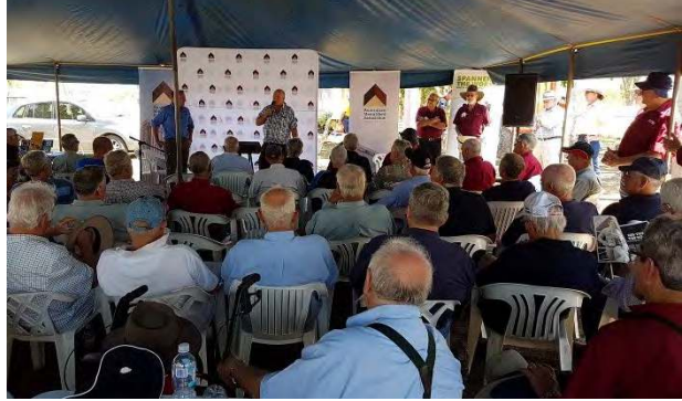
The Mates Shed Roundup at Inglewood Mates Shed (QLD)