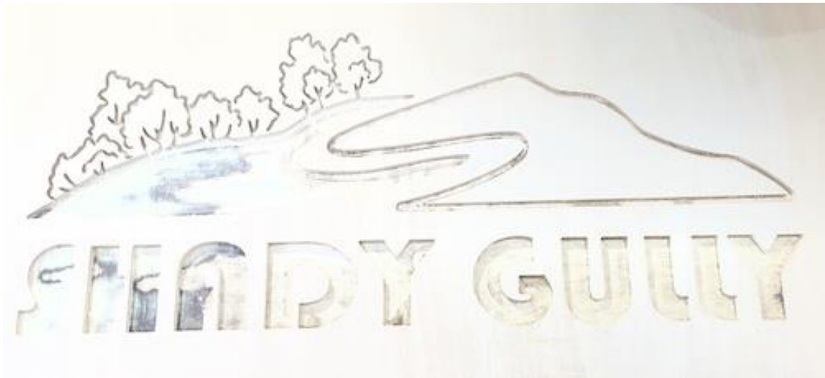
Bike Club Sign produced on the CNC machine.