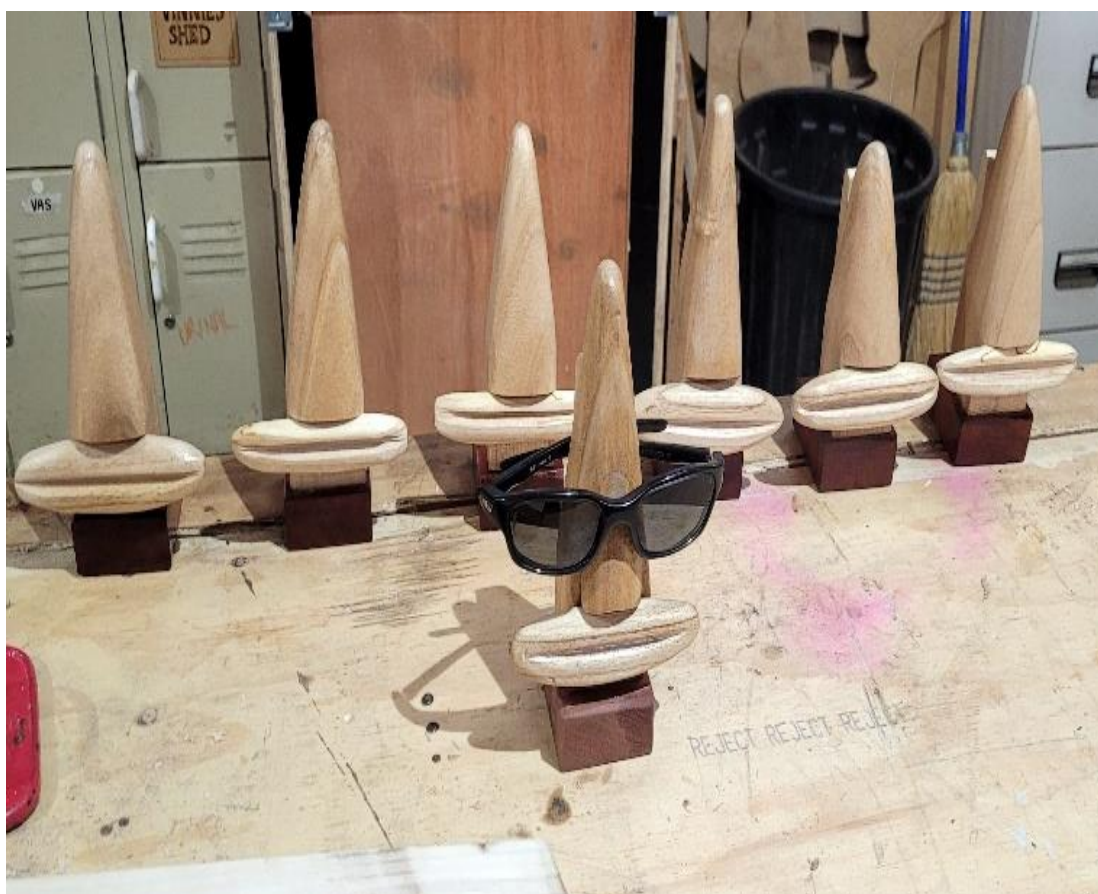
Spectacle stands - very useful! A Mal Darwent invention

Each one is a stick-on quick-release clip for a tea towel or 'post-it' note for your kitchen or fridge, which is much more useful than a piano if you are tone deaf or hard of hearing.