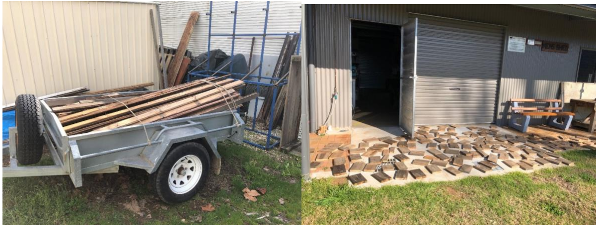
Collect, prepare, split and sell.

Sales of our kindling have gone through the roof with The Shed unable to keep up with demand. If anyone knows of any supplies of potential kindling such as fence palings, old floorboards, timber frames, etc., please let your Shed know so we can make attempts to collect it. No, we won't pull down your neighbour's fence or rip up the floor boards in his house without asking him first.