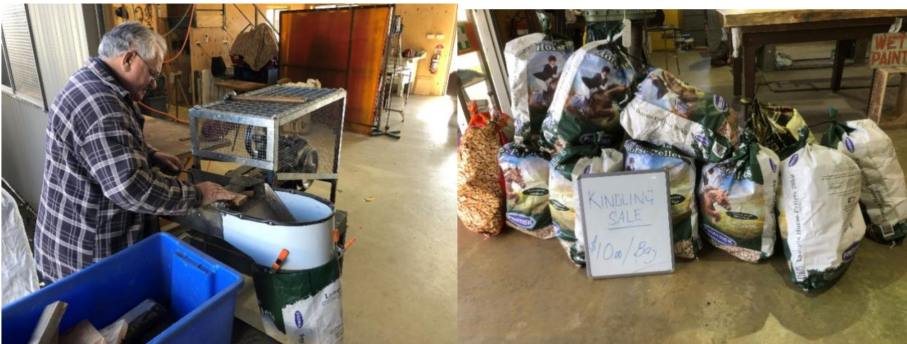
Many thanks to Shane for our latest trailer load. It didn't last long.