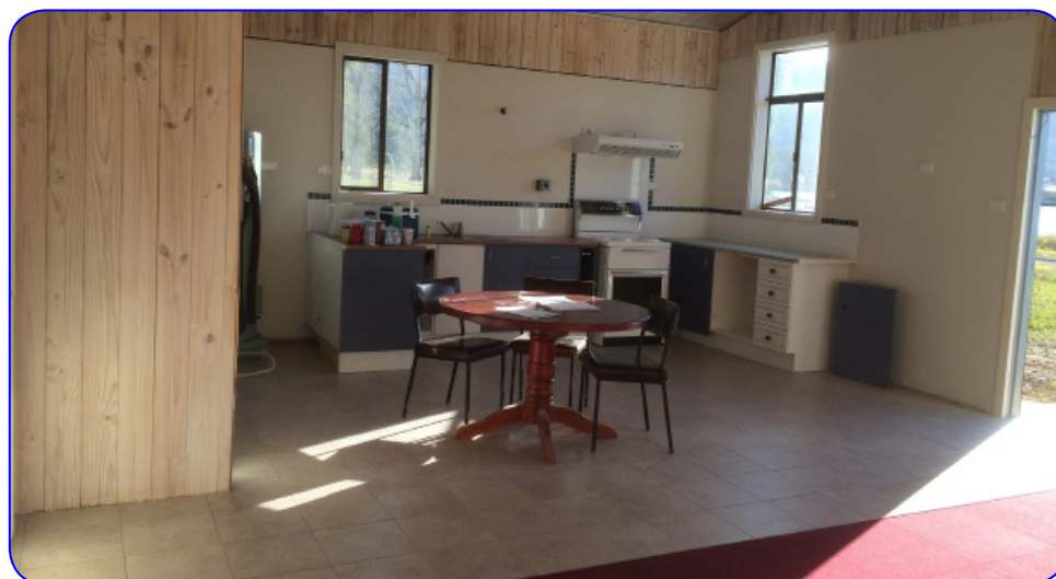
Kitchen & Recreation Area nearing completion – July 2015

Please show your support for the Shed by attending the BBQ and our fourth AGM.