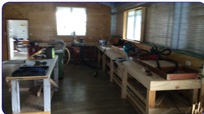
Workshop outfitting well on the way – July 2015