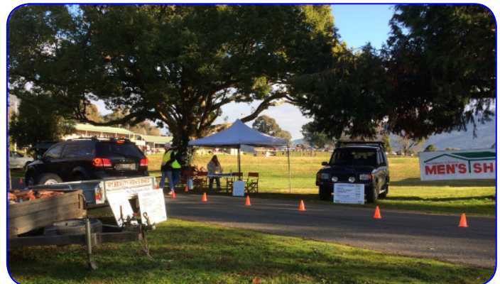
Set up at Dederang for the Football/Netball Club gate raffle