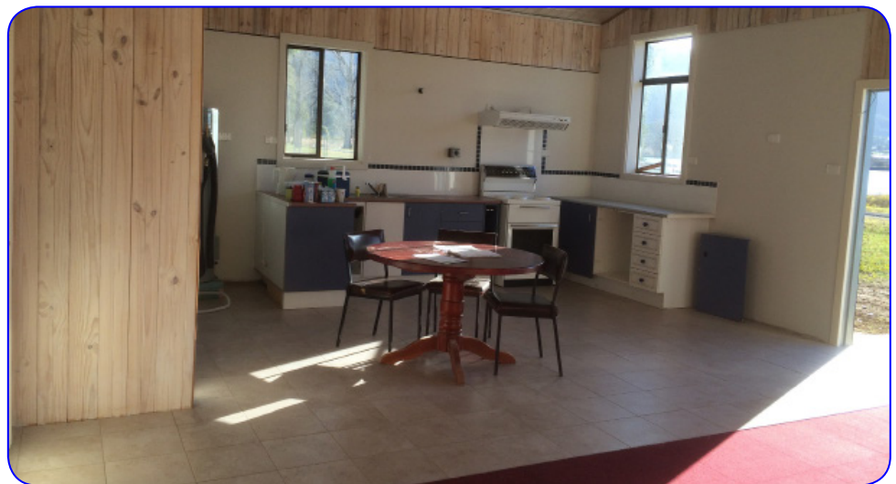
Kitchen & Recreation Area nearing completion – July 2015

Please show your support for the Shed by attending the BBQ and our fourth AGM.