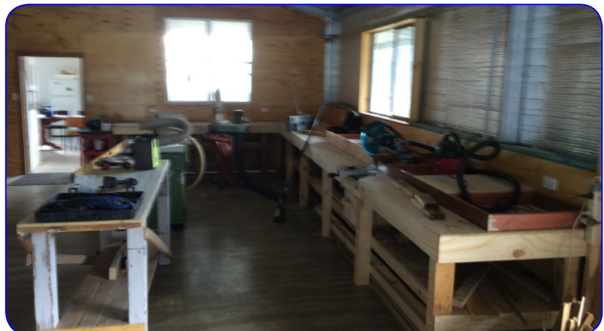
Workshop outfitting well on the way – July 2015