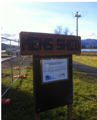
We now have a definite presence