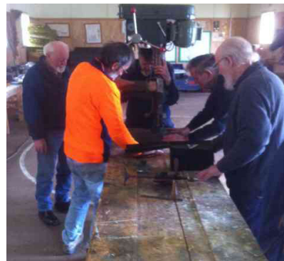
Scout Hall preparations for bunk building