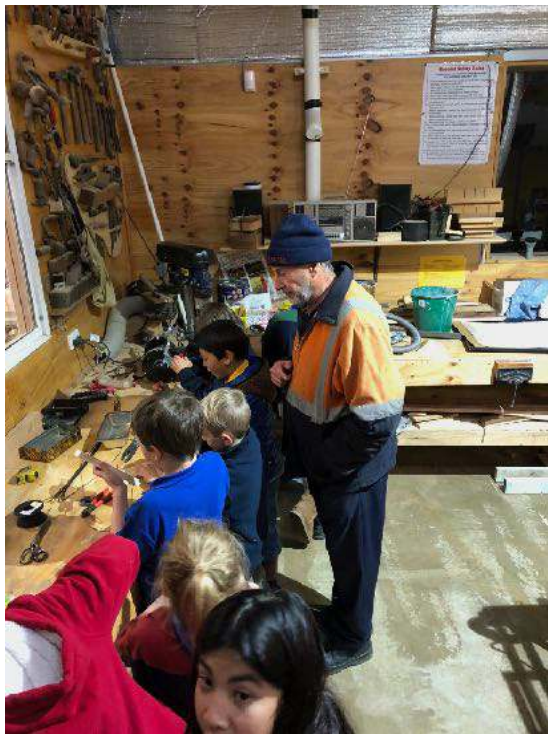
Instructional evening teaching scouts how to use small tools and making a small toy