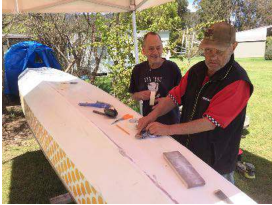
Fibreglass repair on Dragon Boat