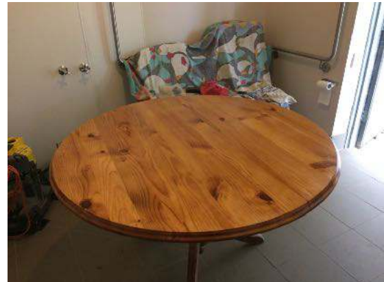
Restoration of a table for the Kiewa Valley House