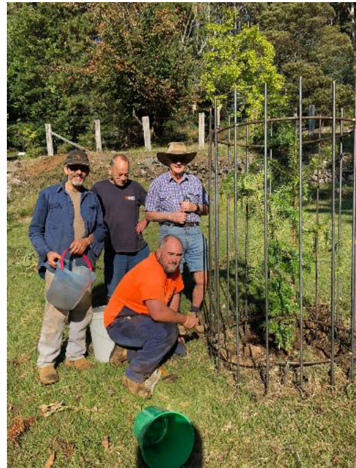
Deer Guard installation at the Clover Dam Arboretum