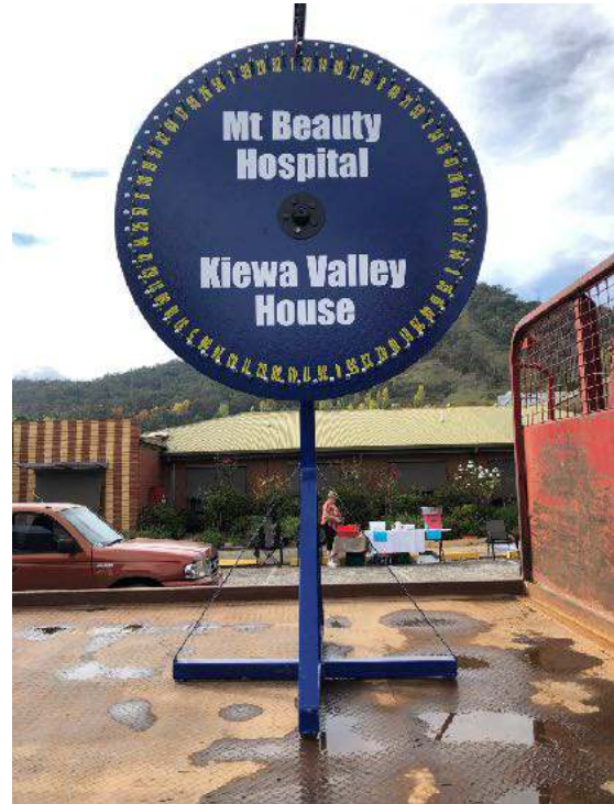
Spinning Wheel is used at the Hospital Easter Fete each year.