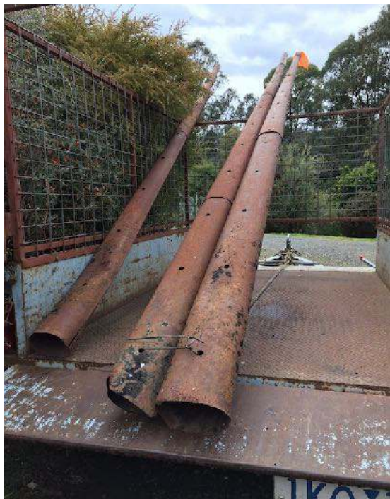
The restoration of old metal Snow Poles from Mt Bogong.