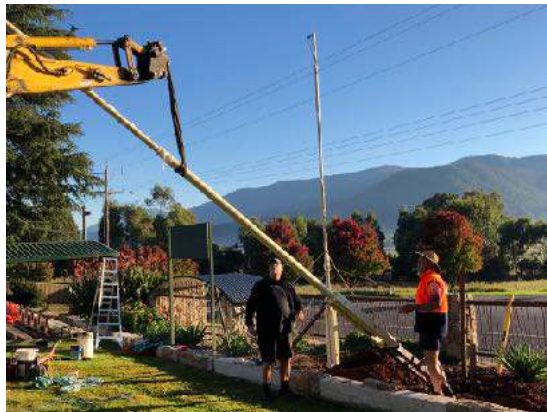
Flagpole manufacture & installation