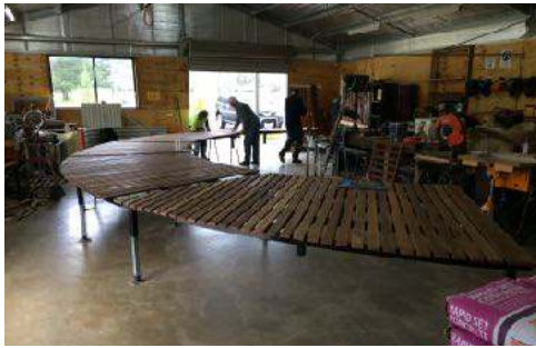
Seat construction in the Shed