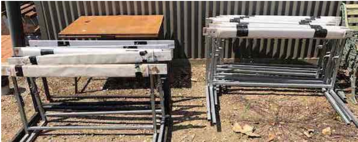
Repaired the complete set of Hurdles