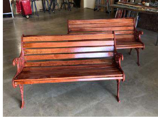
Construction & Installation of two seats at the Cenotaph