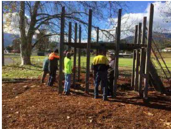
Dismantling – old Fort playground equipment