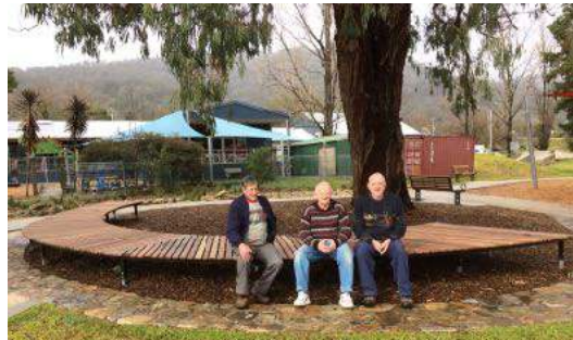
Finish seat at the Playground