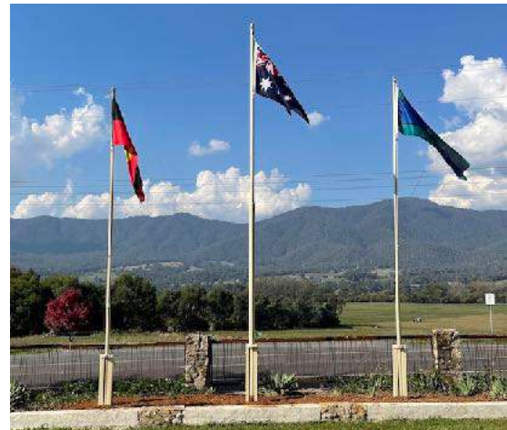
Flagpole erection complete