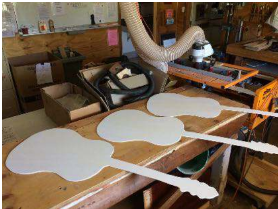
Making cut-out musical instruments for displaying during the Music Festival

Also worked as security personnel during the night sessions of the Festival providing four men for the job.