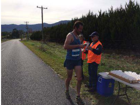
Manning the Drink Stations for this running event (21, 10 & 3km)