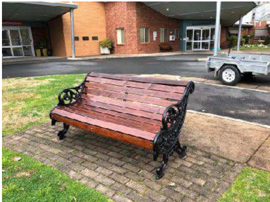
Restoration of a seat outside the Hospital