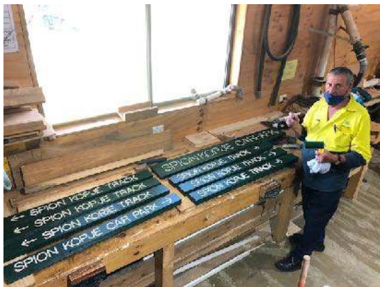
Manufacture of signage for Parks Victoria using the CNC Router.