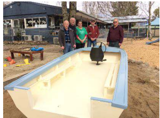
Boat located at the Children Centre