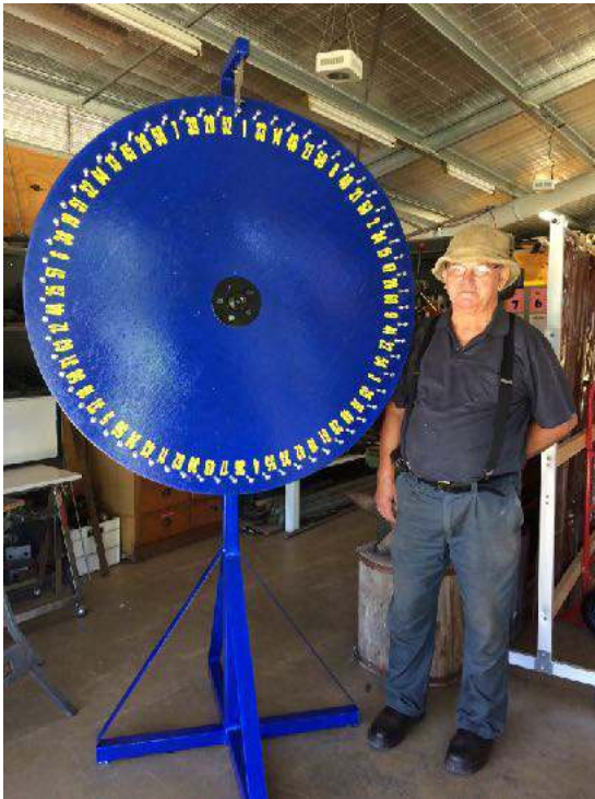
The manufacture of a Spinning Wheel for the local hospital.