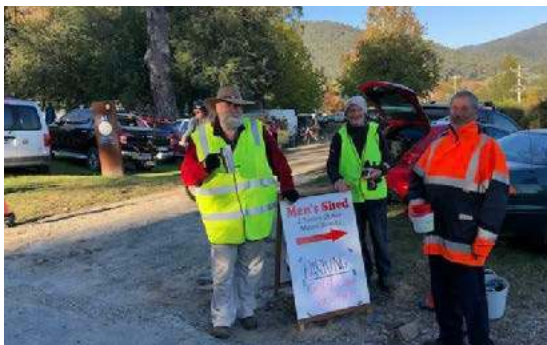
Parking 300 cars for this major regional Mountain Bike Event conducted in Mt Beauty.