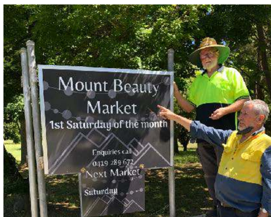
Erection of a sign at the town entry advertising the monthly market