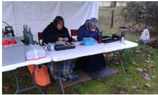
Collecting gate entry money for 9 home games