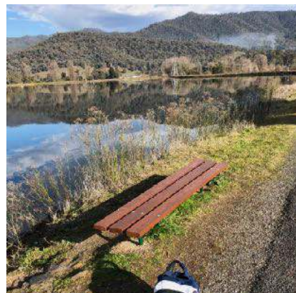
Installation & repair of seats around the Mt Beauty Pondage (Lake)