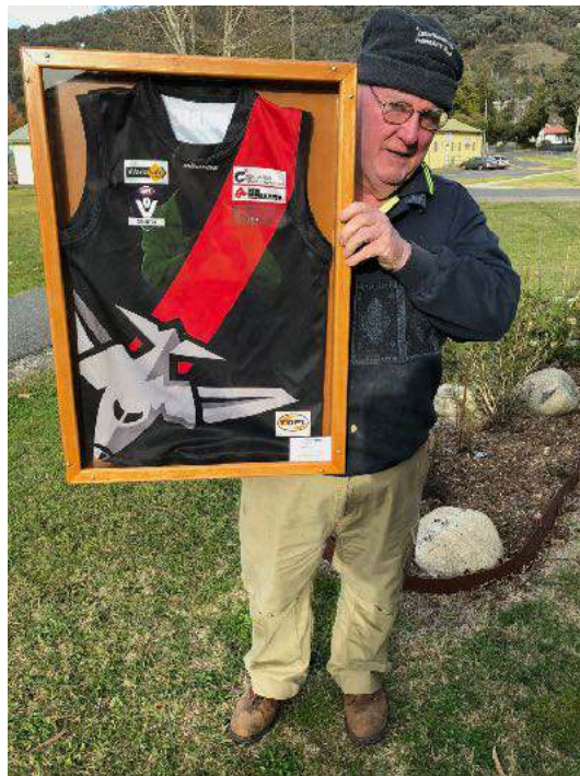
Making of frame to house a football jumper to be used as a trophy