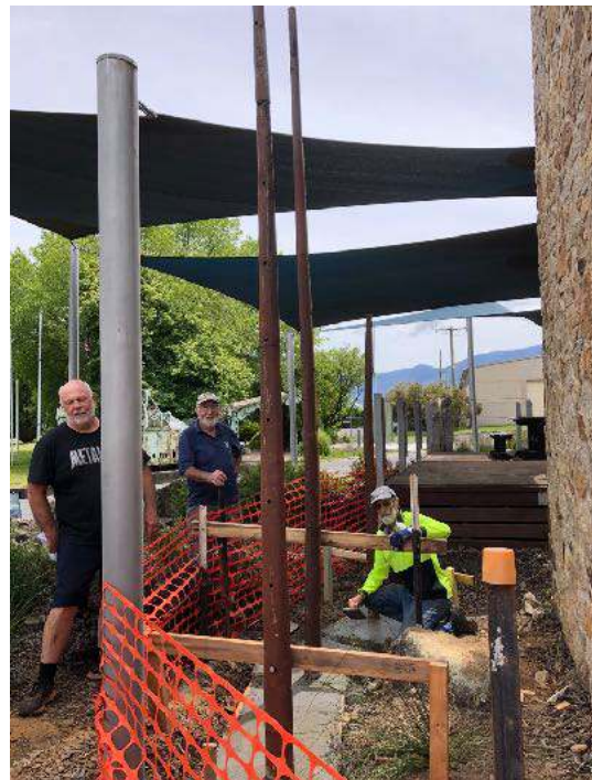
Installation of Snow Poles at the Museum.