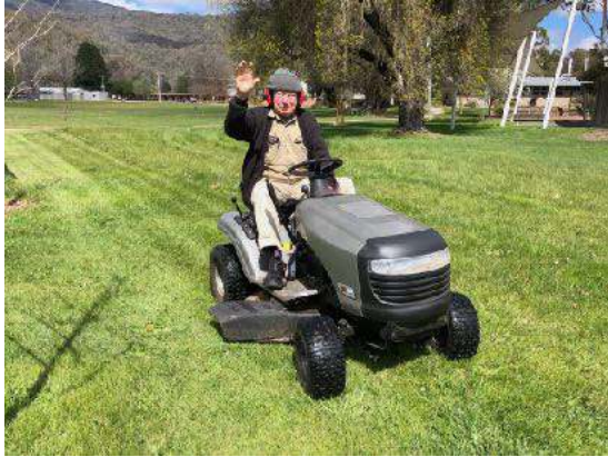
Shed cuts NHCentre lawns ever 2-3 weeks