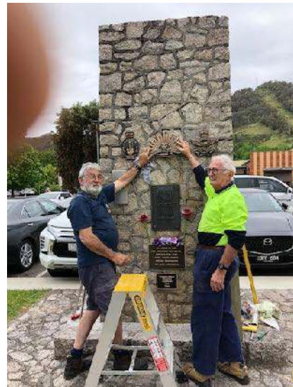
Installation of Army, Air Force & Navy badges on the Cenotaph