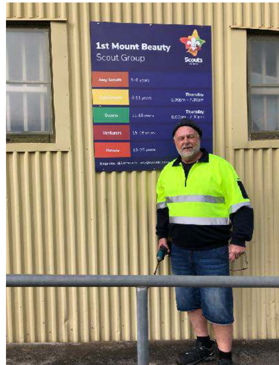
Installing two signs on the Scout Hall