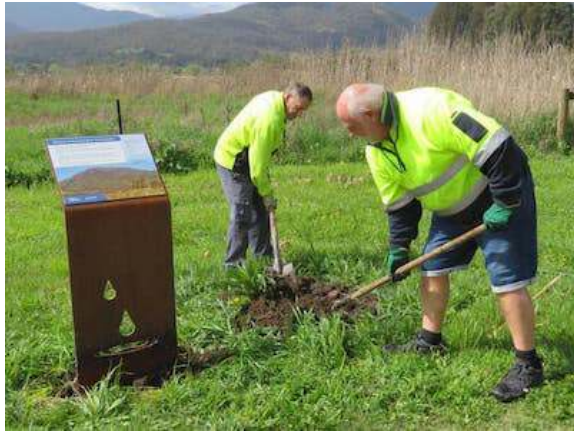
Erection of signage (x3) for the new Kiewa River Trail in Mt Beauty