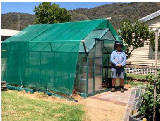
The erection, installation of watering system and the installation of Shade Cloth over it.

Five Shed members assisted the NH Centre to remove all the old tiles from their commercial kitchen to be replaced with indoor lino. This was a 7 hour job.