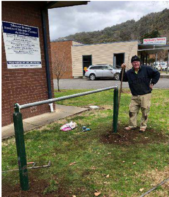
Making and installation of a bike rack .