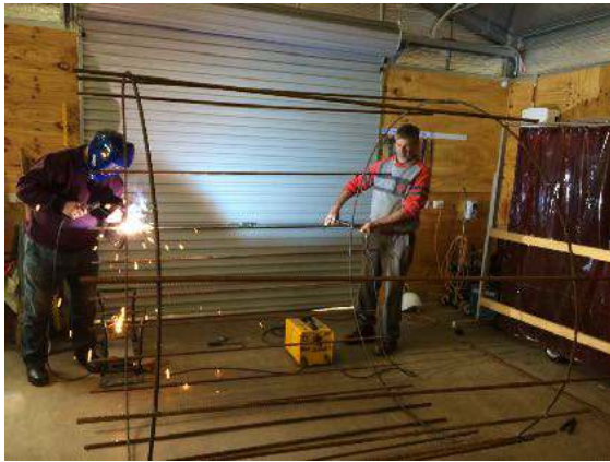
Deer Guard construction