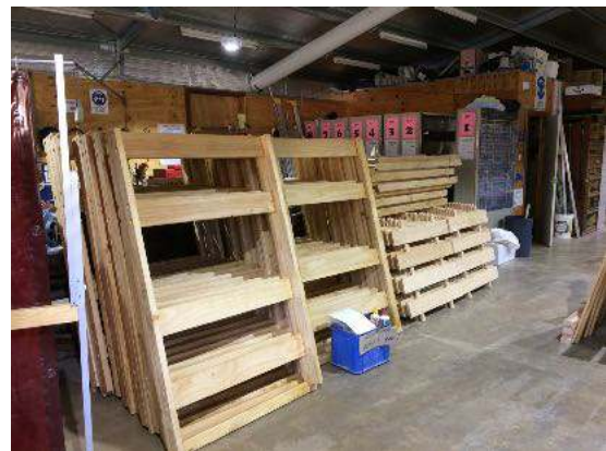
Building 42 Bunks for the dormitory