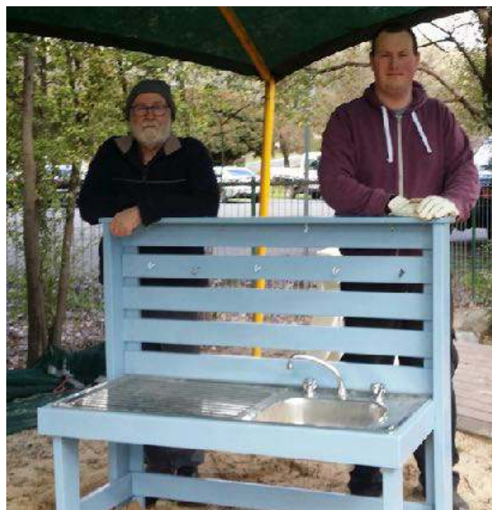
Construction of an outdoor play Sink