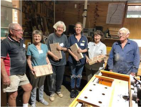
The Shed has conducted this Program for the last 4 years