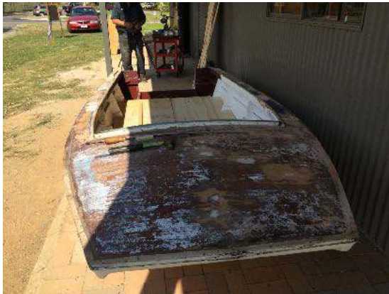
Restoration of an old boat