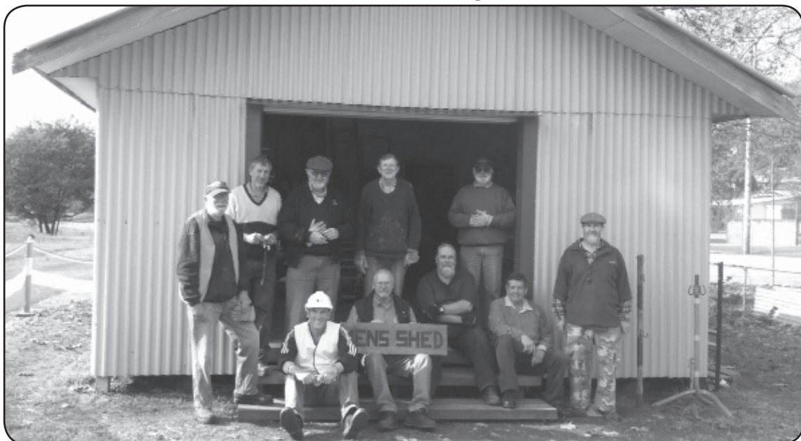
Old Lions Storage Shed refurbished. Some facts: Project took 4 weeks using 18 shed members working for a total of 276 man hours. External painting of roof and walls will be completed in the Spring..