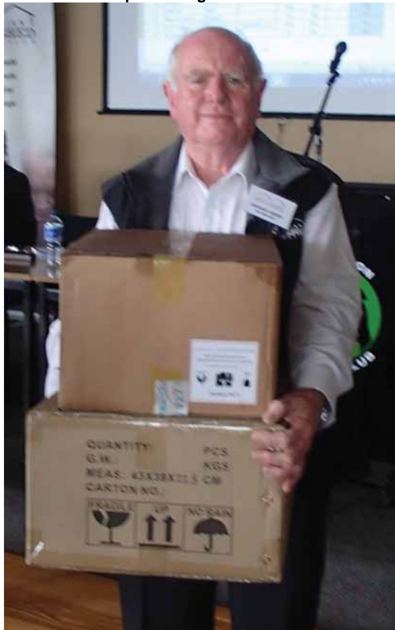
Mirrboo North Shed receiving a Defibrillator.