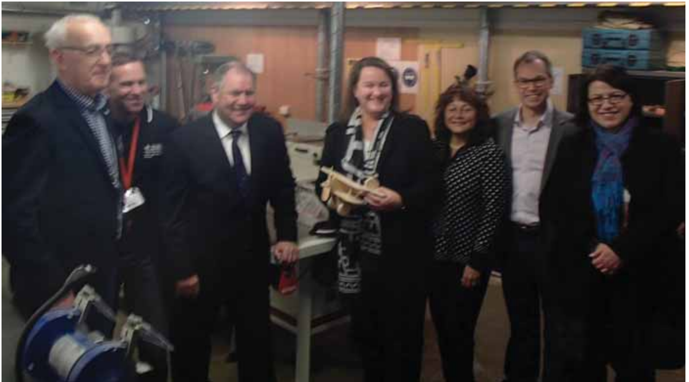
Dignitaries gathered to open the Federation Square Men's Shed.