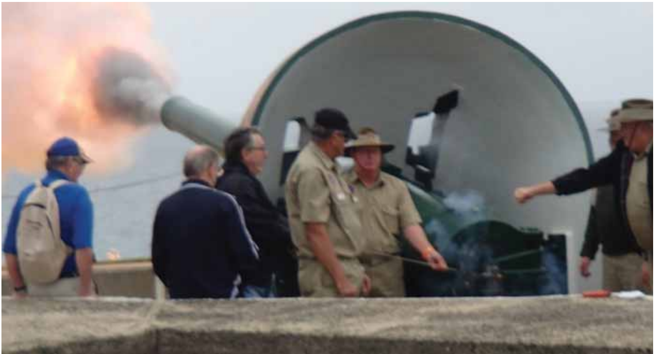
Celebratory firing of the Fort Scratchley cannon