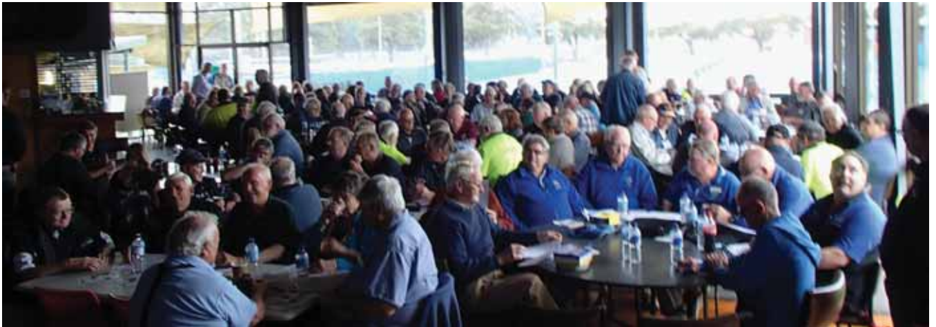
Traralgon Tennis Association was packed to the rafters with almost 200 Sheddies representing 70 + Sheds