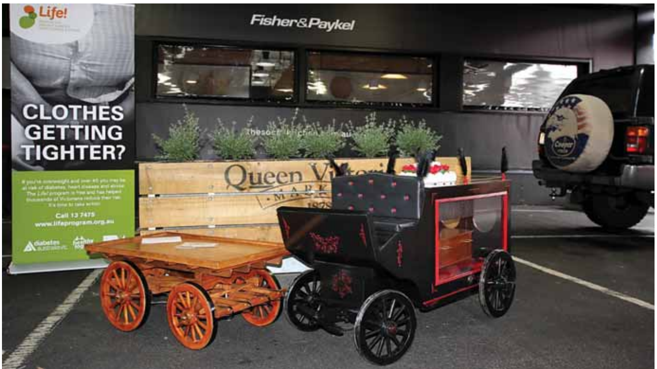
Two Coffee tables which are fine examples of quality work from the Northern Men's Shed