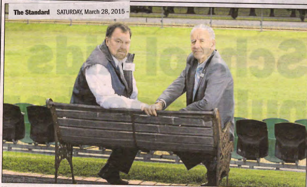
The Standard SATURDAY, March 28, 2015