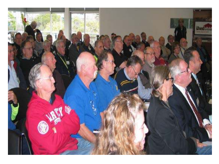
Shed representatives enjoying the presentations.