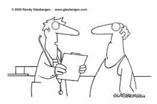
"The handle on your recliner does not qualify as an exercise machine."

We started with a lecture and question time followed by preparation of ingredients and then cooking at their shed. From the reports received later, the training class was a success for their members and they then had a successful day with their Sausage Sizzle at Bunnings in Morwell. (Once again "Mudgie" to the rescue! Great work.)