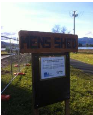
We now have a definite presence