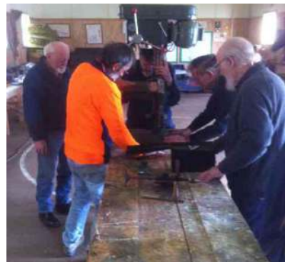
Scout Hall preparations for bunk building