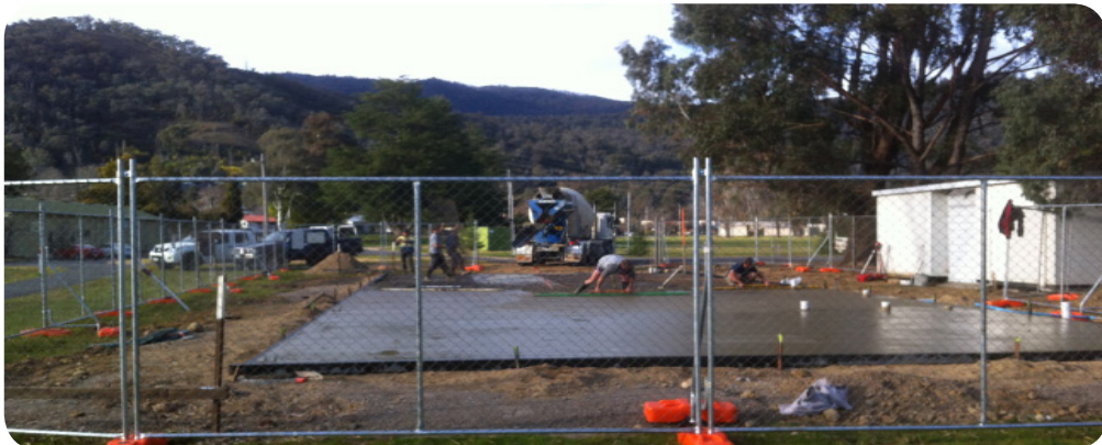
It's happening — foundations