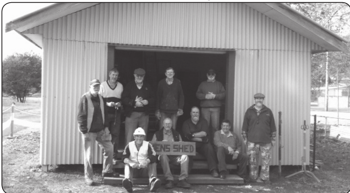
Old Lions Storage Shed refurbished. Some facts: Project took 4 weeks using 18 shed members working for a total of 276 man hours. External painting of roof and walls will be completed in the Spring..